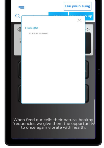
Connecting to Bluetooth screen